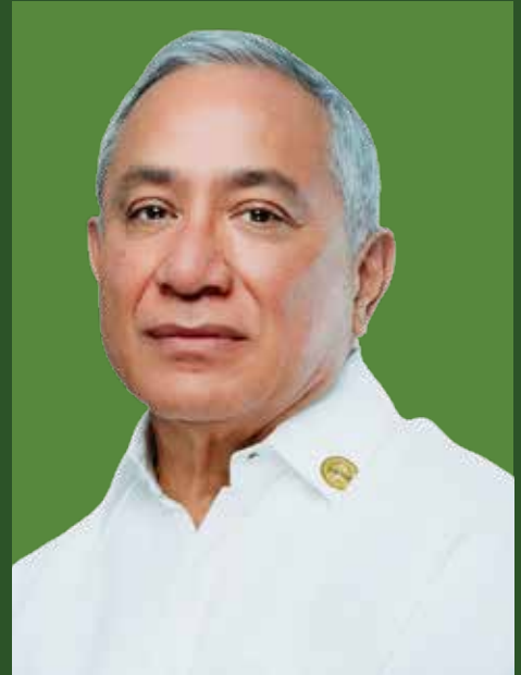
Hon. John Briceño

On behalf of Belize, I sincerely thank the ACMF for its vision and dedication to uplifting our region through maritime education and development. I wish all attendees an enjoyable evening of celebration and fellowship.